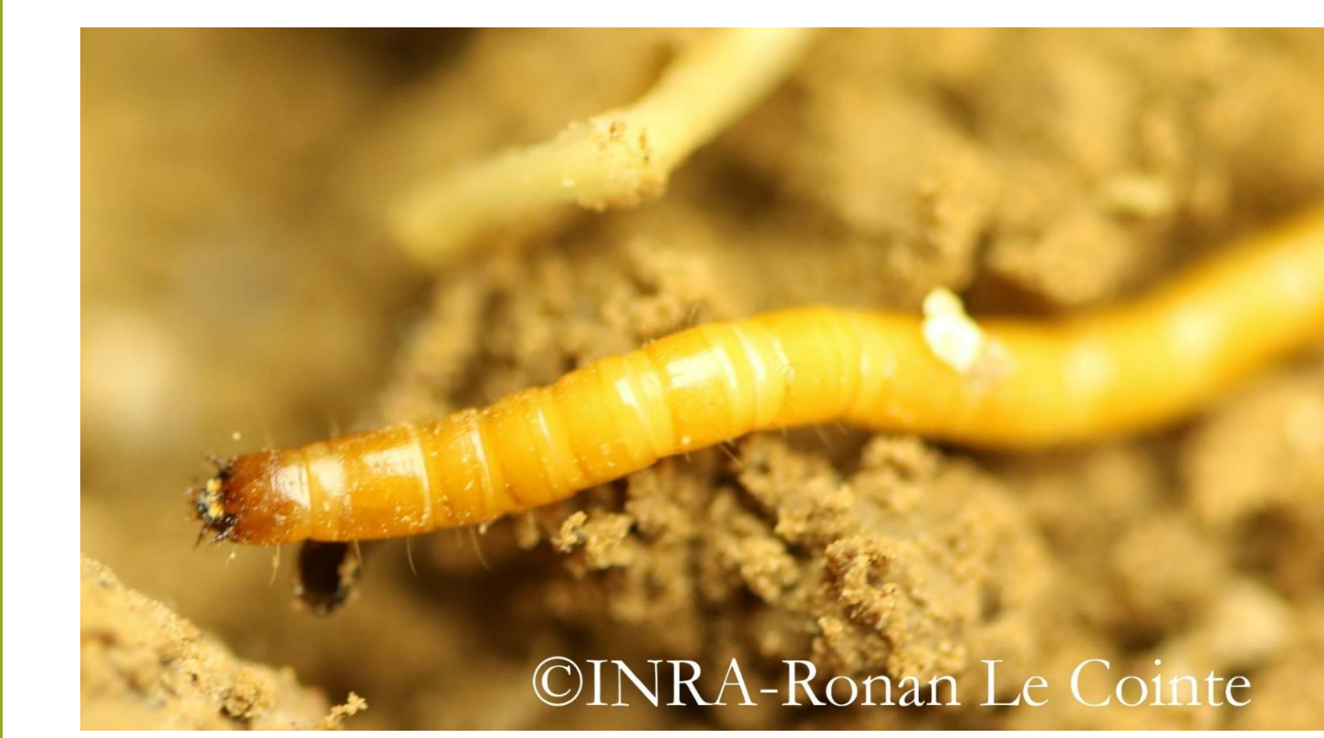
Fig. 1. Wireworms

• Wireworms (WW) (Fig.1), the larvae of click beetles (Coleoptera: Elateridae), have been damaging a wide range of crops worldwide since long [1-3].