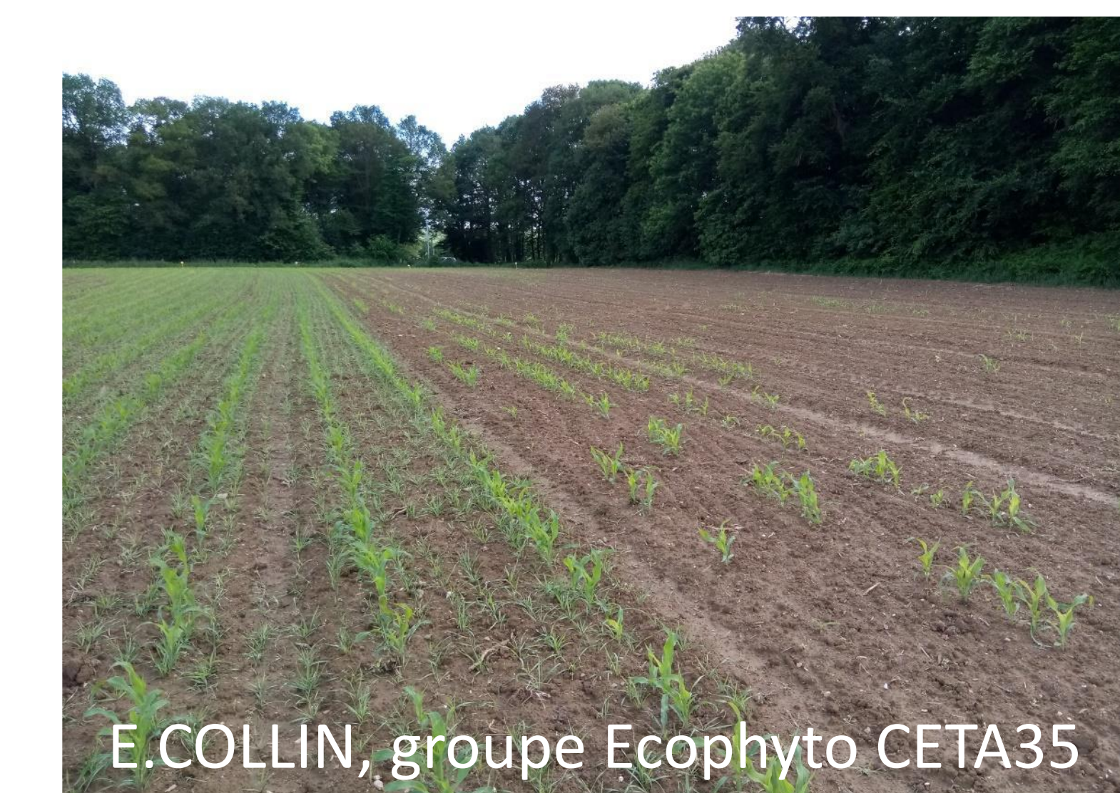
Fig. 6. Maize seedlings damaged (on the right) and protected with wheat companion plant (on the left)

• Our results (Figures 5 and 6) show that intercropping protects maize seedlings from wireworms damages.