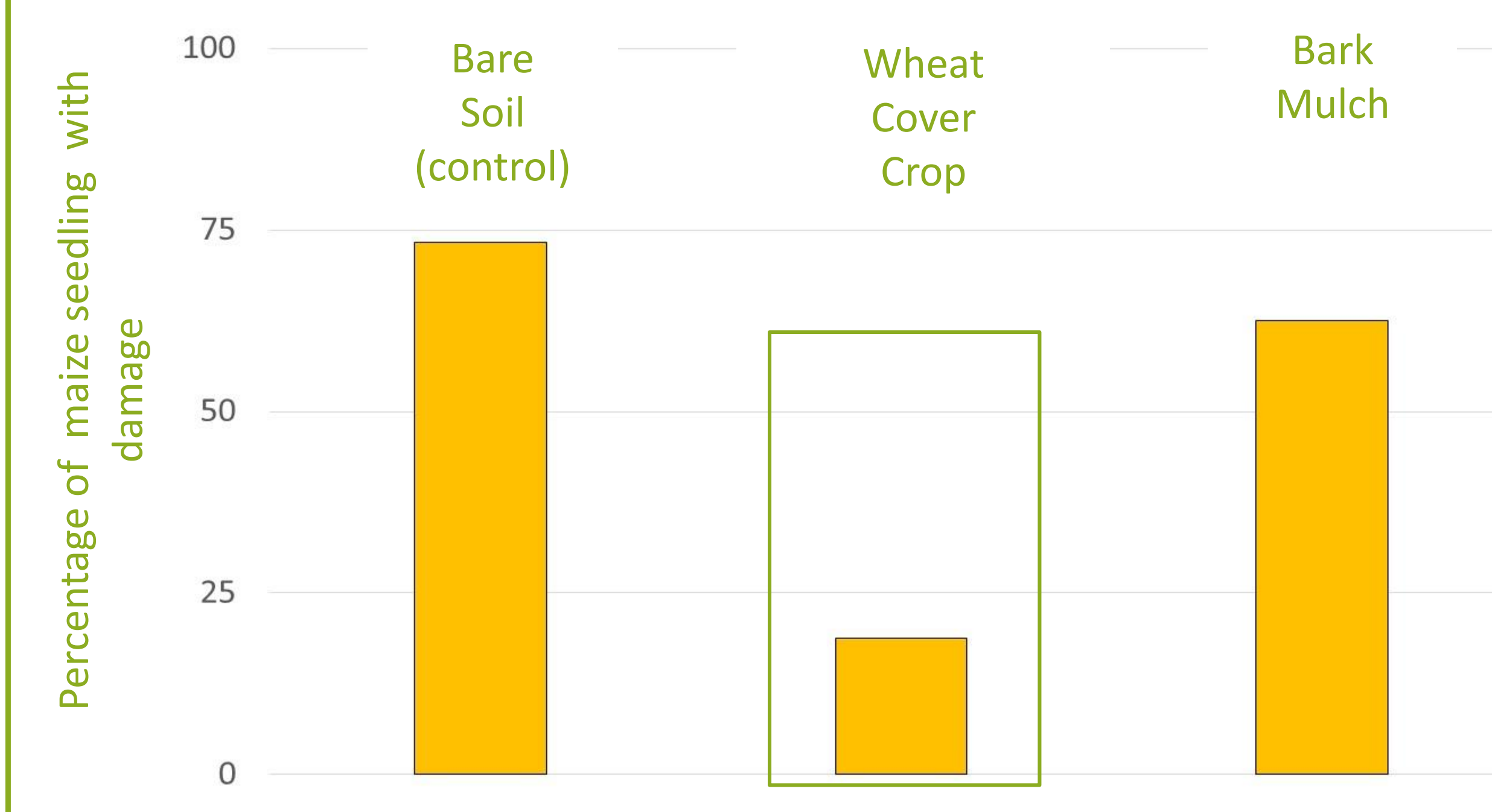
Fig. 4. Percentage of maize seedlings damaged by wireworms according to the type of soil cover

• Our results (Figure 4) show that the soil organic cover protects maize seedlings only when organic matter is fresh.