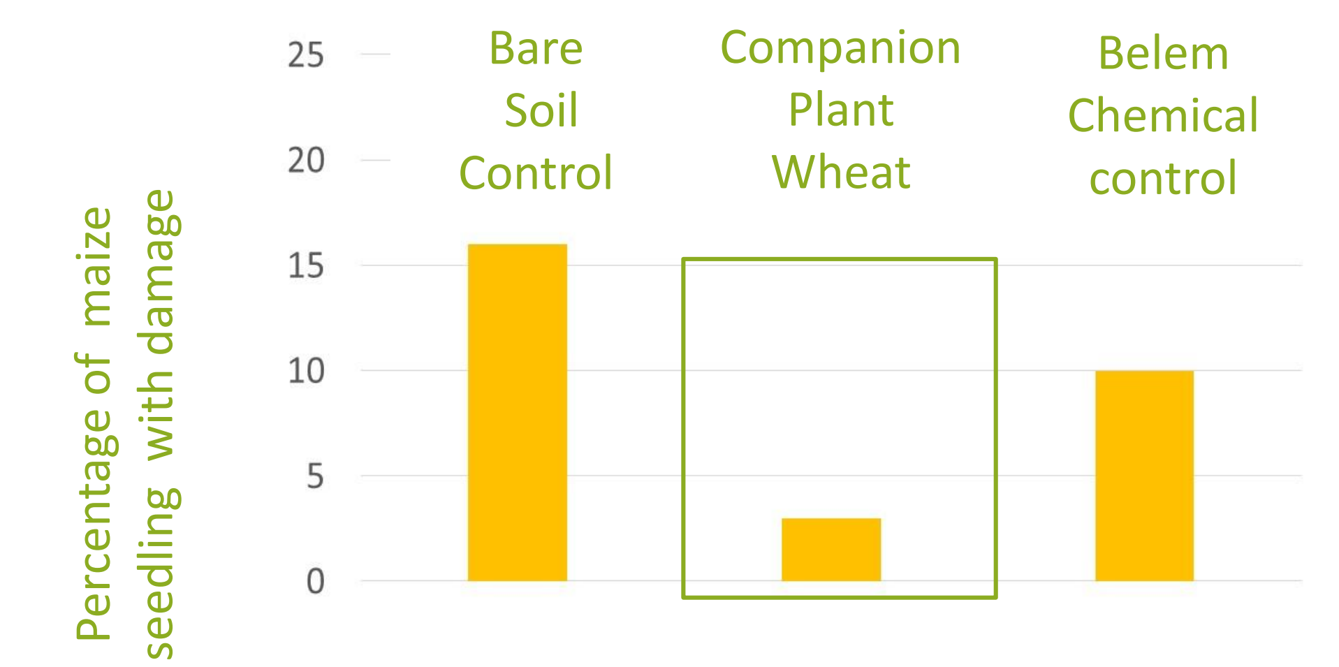
Fig. 5. Percentage of damaged maize seedlings